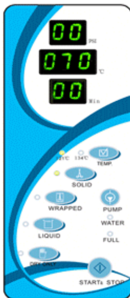
Control Panel (BioClave 16)