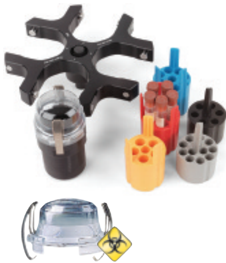
S41 Swing-Out Rotor (11210246) 200 ml standard bucket (11175611) with sealing lid (11175612) and adapters for variety of applications