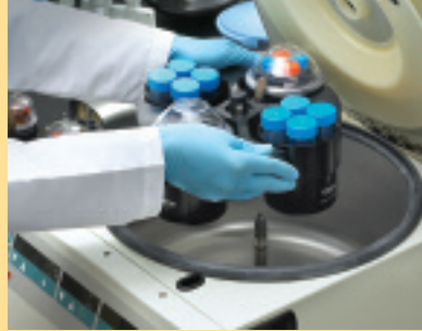
2. Instantly unfasten and remove it.