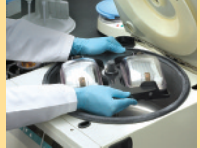
3. Snap in your microplate rotor, and you're ready to spin again – in less than 5 seconds!