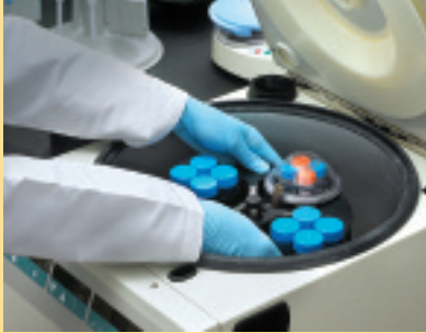
1. Snap in your swing-out rotor and lock it in place.