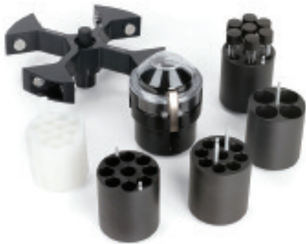
T41 High-Capacity Swing-Out Rotor (11210435) 280 ml standard bucket (11210436) with sealing lid (11175712) and variety of inserts to meet your specific application requirements