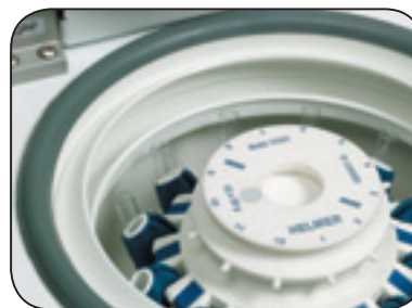
Saline Removal Channel