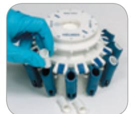
12-place rotor with removable 10 x 75mm inserts